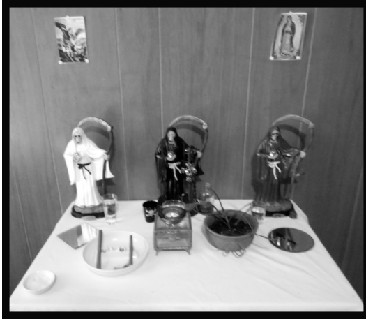
Author's personal altar Used with permission of the author

At some point you will want to set up an altar to your holy guide most holy death, again start with the white robe form. Make sure that everything on the altar is white, her image or statue, candles, offering plates etc... You do not want to taint La Blanca with anything by using a non-white color on her altar.